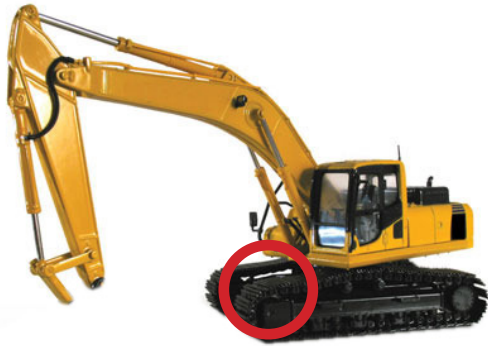
Existing Bulldozer Blade Mounts (To make installation simpler)