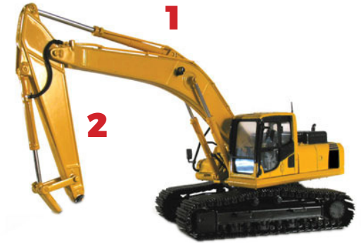
Two-Piece Boom (Increases rigidity and reduces cost compared to a 3 piece boom)