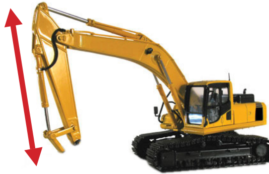
Short Dipper Boom & Large dia. Pivot Pins (Short dipper boom allows greater control of the VRS Grab when operating close in to the machine, Large dia. pivot pins - for strength and longevity)