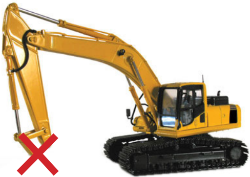
Quick Coupler on End of Boom Adds Extra Weight (To be used only if required)